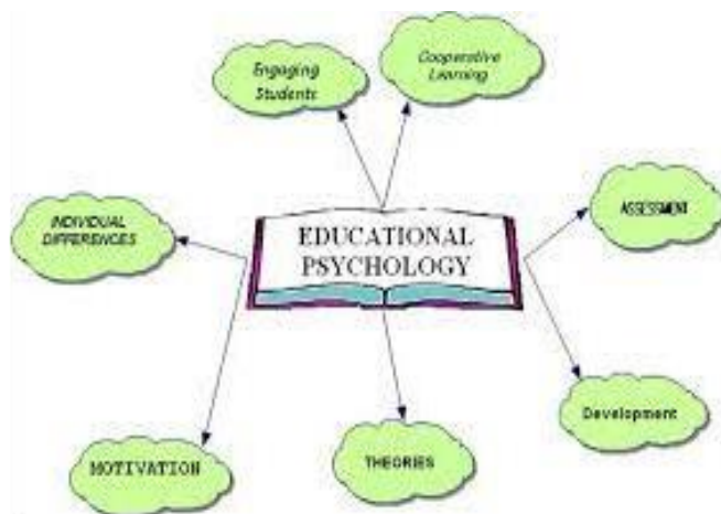
Figure 2: Educational psychology

Educational psychology supports the scientific study of humans and learning something new. The goals or purpose of educational psychology predicting understanding and controlling the behavior of humans in learning situations. Thereafter the concept of educational psychology is based on how people learn by using several teaching methods, different learning processes, and instructional processes [3]. Therefore, educational psychology impacts the learning of humans as well as it impacts the learning processes that humans adopt to learn. Thus, the impacts of educational psychology on the learning processes of humans are analyzed in this particular research study properly.