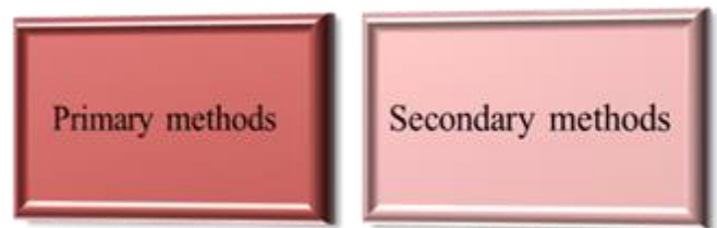
Figure 3: Methods for gathering data

There are several types of methods and techniques that are used to create a reliable and readable and objective research study. Therefore, the usage of proper and accurate research methods in a research study is very important. Apart from that, choosing the appropriate method for the specific research study is more important [4]. Thus, the researcher has used a particular method for collecting data and a particular method for analyzing all the data in this research study. There are mainly two types of methods for gathering data such as primary methods and secondary methods [5]. The sources of these two methods are effective and efficient to collect appropriate data about the research topic. Thereafter the sources of primary methods are based on real-life experiences and activities.